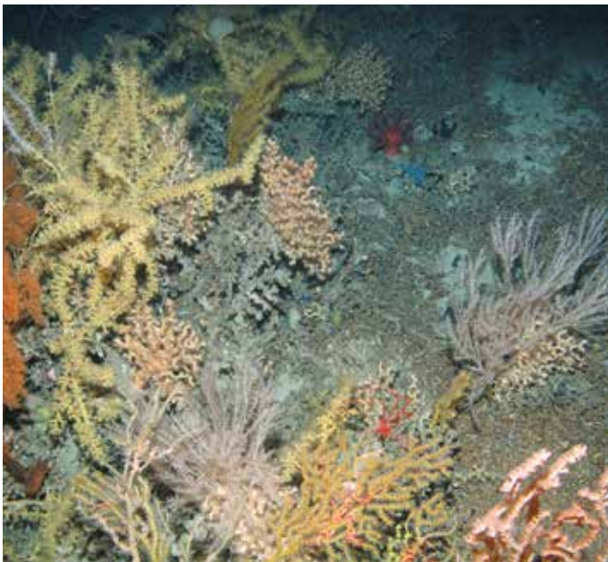
The Anton Dohrn seamount in the NE Atlantic.

The deep-sea areas off the British Isles, though cold, dark and remote from land, are teeming with unique life: cold-water corals, sponge fields, and a large variety of unique underwater habitats and species. Some have been discovered only recently by scientists, and it is likely that many more are yet to be found 1 .