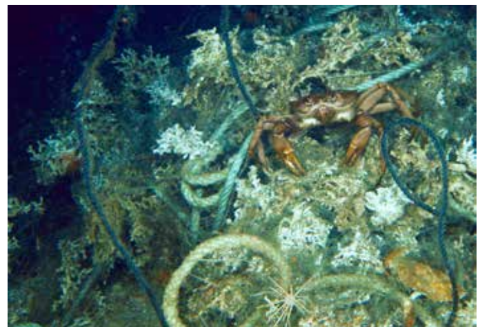
Ghost net off Ireland at 1000m depth.

Yet, even though these ecosystems are vitally important and there is clear evidence of the severe damage caused by deep-sea bottom trawling, UK researchers concluded that the deep-sea areas currently closed to bottom trawl fishing in UK waters together make-up only a fraction of the areas where vulnerable deep-sea ecosystems are likely to occur 10 .